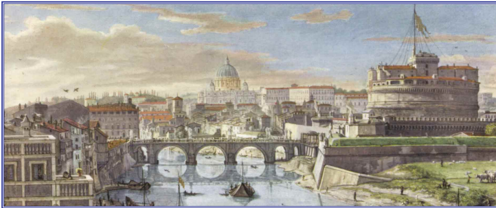
Vanvitelli (1653-1736) "Rome, Tiber View"